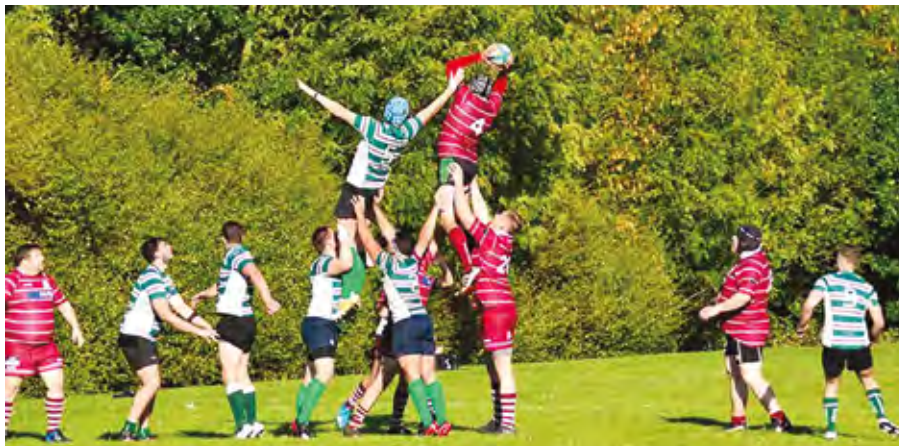
Hitchin winning the line-out again against Hendon