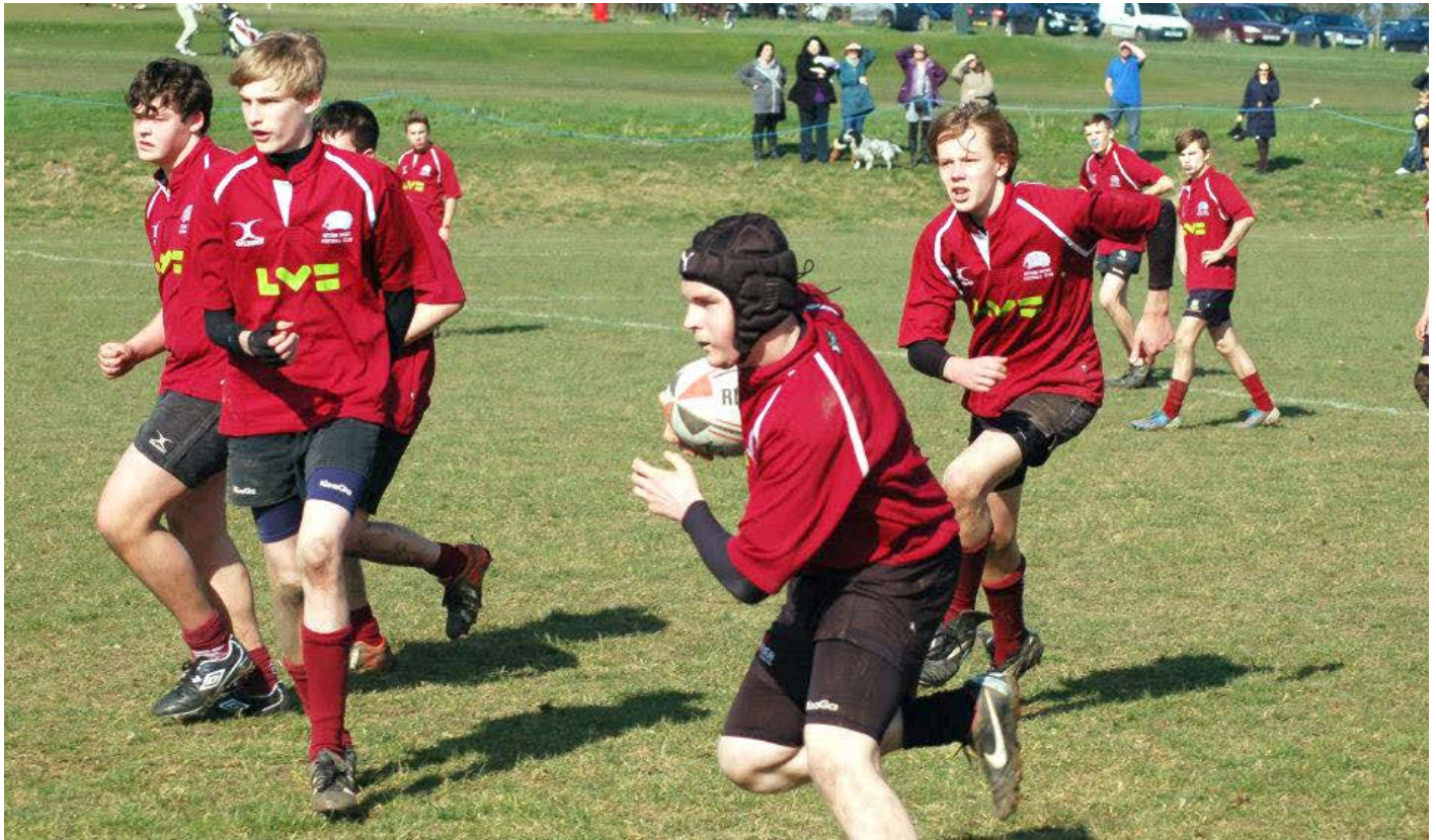
Hitchin U16Bs v Royston