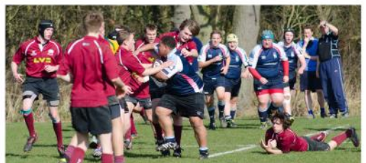
U15's v Bedford