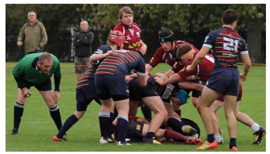
Hitchin Academy in action in their win against Old Albanians U18