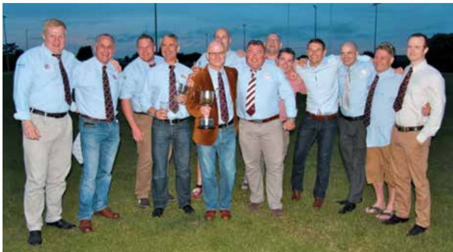
At the End of Season Awards ceremony, the President's Award for Team of the Season went to the Hedgehogs!