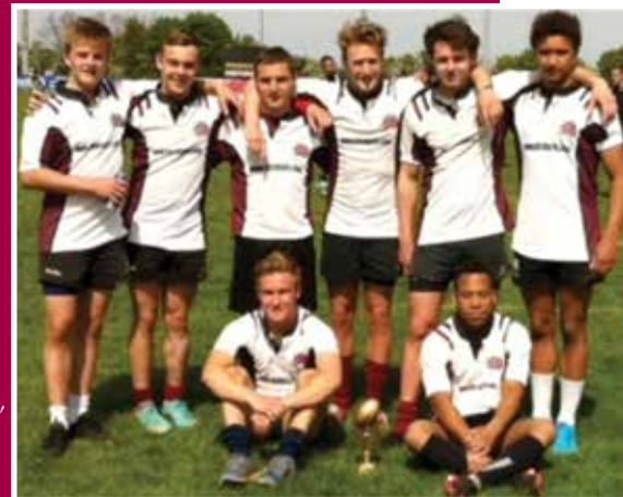
Hitchin under 18s win the "Road to Rio 7s" at Ipswich

It says much about attitude and expectations that the squad felt it was a below par season!