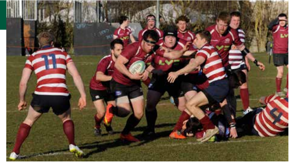
Skipper leads the way against Welwyn RFC

Had it not been for a few near misses and narrow loses the team could have easily finished in the top half of the table and threatened the top four. The 1XV has been well supported by the academy again as well as a number of new recruits. We are also looking forward to seeing several players returning again next season from university as well as