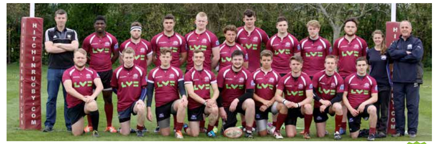
Academy squad for LV= U 18's cup final