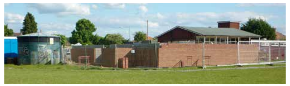
... the walls are up