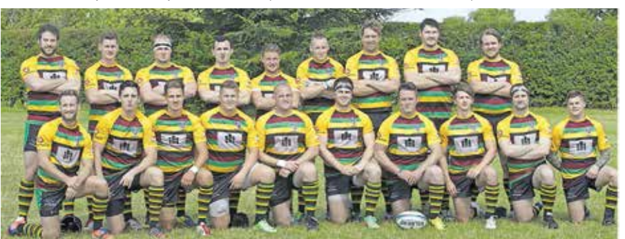
Too hot to handle: the Herts Barbarians side were comfortable winners in the big game

"Raising more than £1,500 from the auction alone was fantastic and I am very proud to have been involved in such a wonderful and worthy event."