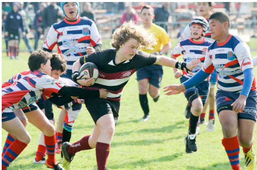
Hitchin fought off all comers

Hitchin RFC U14s... European Champions !