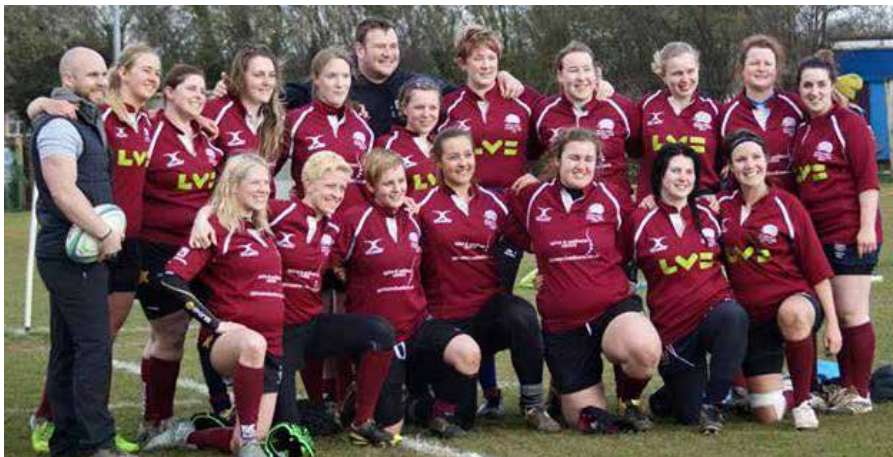
The Ladies team