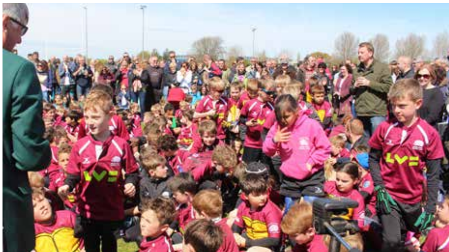
Prize giving at Founders’ Day

Perhaps also as importantly behind the scenes by the various Coaching Team members who all perform in quietly understated role in delivering top quality