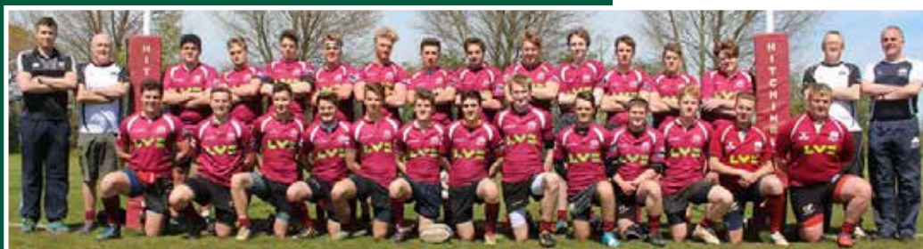
Academy squad for LV finals day

Highlight for him was captaining Saracens against Lambs in a 32-5 victory and he is looking forward to playing against Ulster, Bath, Harlequins and Wasps early next season.