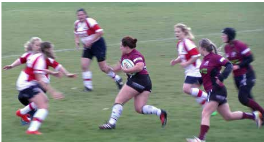
"Crampers" on the attack for the Ladies

Most notably this year, the ladies team set out to make a naked calendar to raise a bit of money for the team. What started out as a bit of fun spiraled into viral coverage. The calendar was featured in The Mirror , The Mail , The Comet (three times), The Sun , The Lad Bible , and shared by 50 Cent, as well as numerous