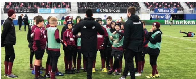
U12s at Saracens' clinic

The academy (Boys U16 to U18) is truly back on with several training sessions a month (some linked with the seniors' sessions) and a number of matches have been played against other academies (Harpenden, Amersham, Shelford among others).