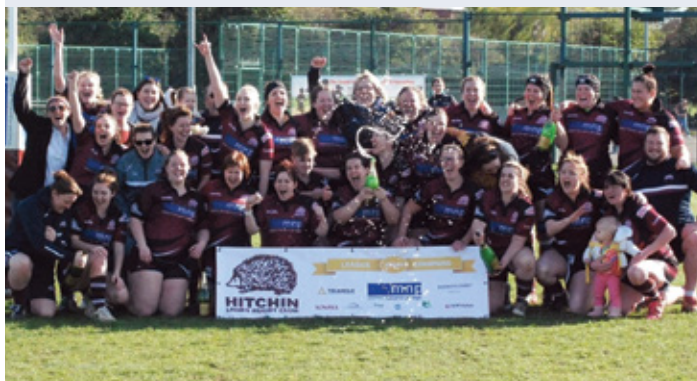
The undefeated Ladies

Going forward, we aim to continue the first team's success in the new National Championship 1 level while developing our new second team. Recruitment will remain our primary focus to ensure new members can develop the section further. We're optimistic that we can make the next season as enjoyable and successful as the last one.