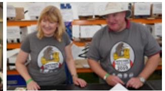
The Tasko's ready to serve