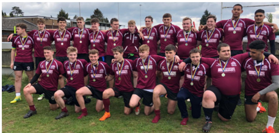
U18 Herts Cup Final Runners Up

friendly environment, to help them transition into adult rugby and fulfil their potential.