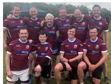
Touch at HRC - fun for all over 12s

For more info as to how to get involved, please email touchrugby@hitchinrugby.com , or contact us via our Facebook page.