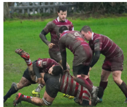
A muddy day at Finchley

In the Cup we ran unbeaten West Norfolk close before they ran away with the semi-final in the last 20 minutes.