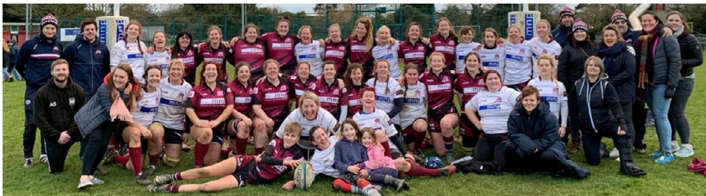
Ladies squad 2019-20

This year has been another incredibly successful year for Hitchin Ladies, with the First XV topping the NC 1 Midlands league and the Second XV finishing third in the Women's Challenge Series South East (North).