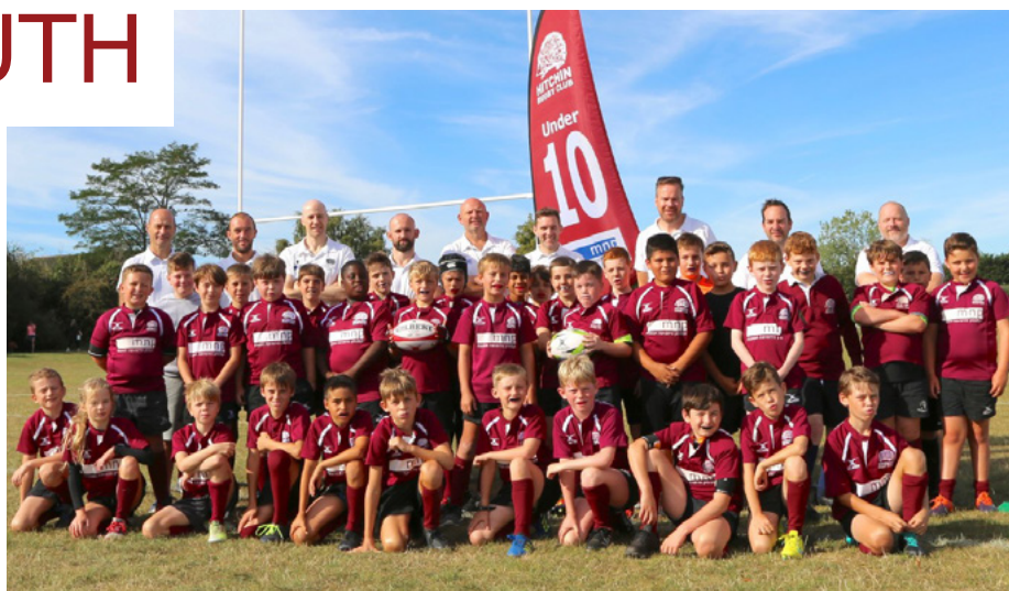
Our fantastic under U10s

U10s season was full of increased levels of team work and outstanding