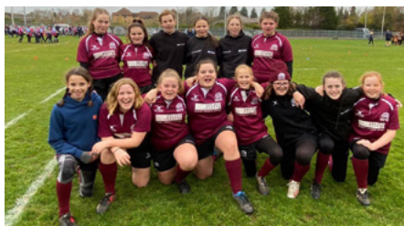
Some of the girls at the England v Italy game as guard of honour

All three age groups took part in the guard of honour and flag-carrying at the Women's international England v Italy held at Bedford Blues.