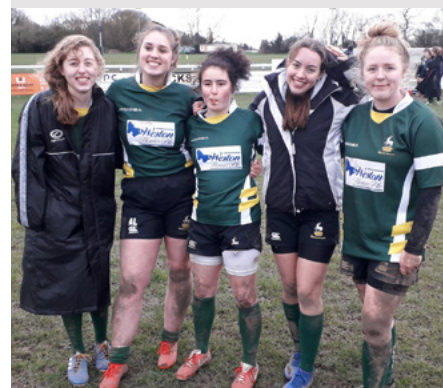
Some of the U18 county girls