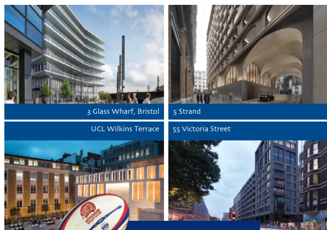
3 Glass Wharf, Bristol