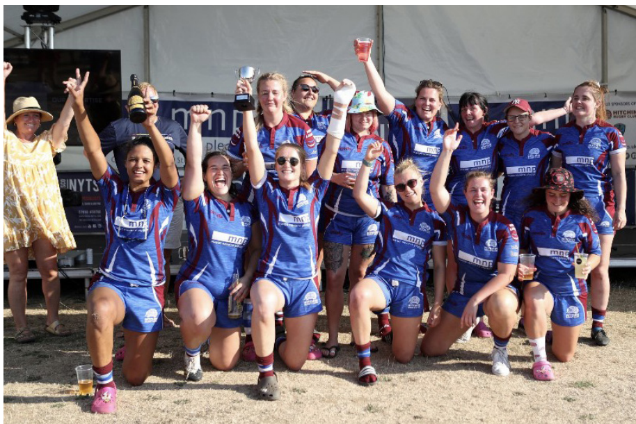
Hitchin Ladies retained their trophy

A rugby loving Welshman- what more do you want!