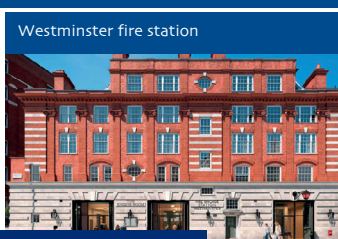
Westminster fire station