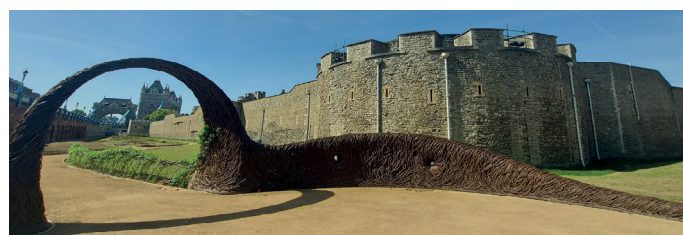
Tower Super Bloom

Congratulations from your clubmates at Hitchin Tim. Quite a rugby CV there and we know the reputation of Hitchin Rugby is further enhanced by your service to the game.