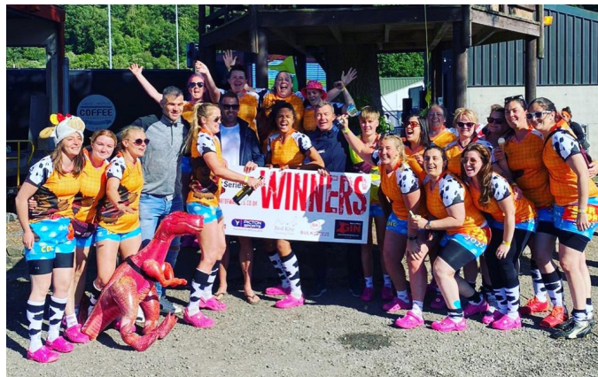
The Ladies win the cup on tour at Heart of Wales 7s